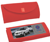
Conveniently Folds Up