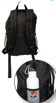
Mesh Pocket On Both Sides