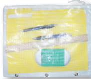
Protects & Stores Belongings