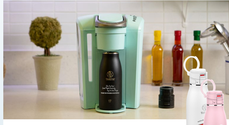
INSULATED STAINLESS STEEL TRAVELERS Prevents spills and keeps your favorite drinks at the perfect temperature.

Originals Bottles with spout lid in 18, 24, 32 and 40 oz. sizes.