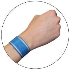
Easily Snaps Onto Wrist, Arm or Ankle