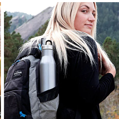
THE ASPEN BOTTLE 16 & 25 oz.