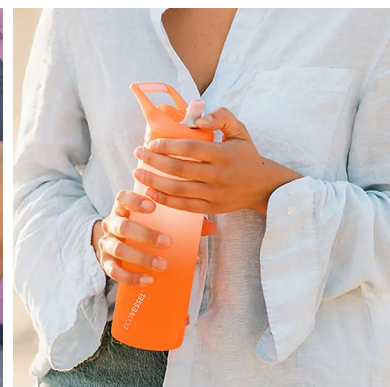
THE WAVE BOTTLE, Tritan 24 oz.