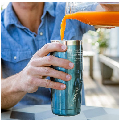
THE METRO TUMBLER 16 oz.

EcoVessel creates premium hydration bottles, mugs, and tumblers that blend style and performance with a mission to reduce single-use plastics.