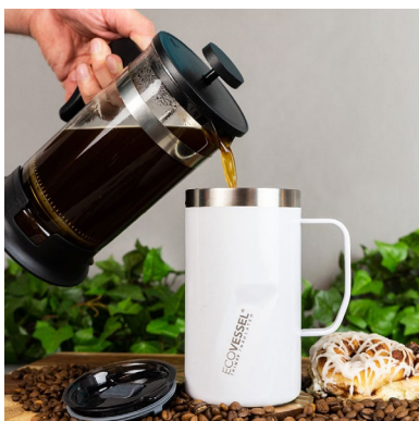
THE TRANSIT MUG 16 oz.