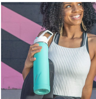
THE SUMMIT BOTTLE 24 oz.