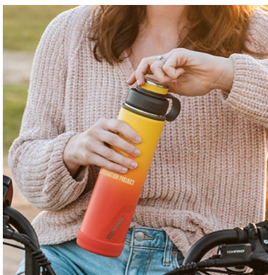
THE BOULDER BOTTLE 20, 24 & 32 oz.