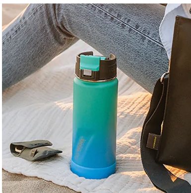
THE PERK TRAVEL MUG 16 oz.