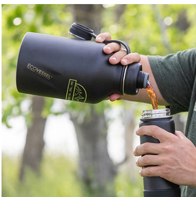
THE BOSS GROWLER 64 oz.