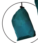
Packs Into Attached Pouch

FCD Full Color Digital 30 pcs. min. 80-60074 $14.25 Each